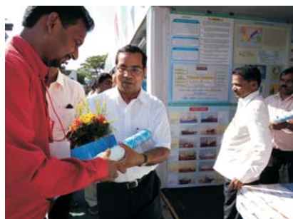
FSI participated in National Fish Festival 'BENAQUA 2010' held at Kolkata, West Bengal during 1-4 October, 2010.