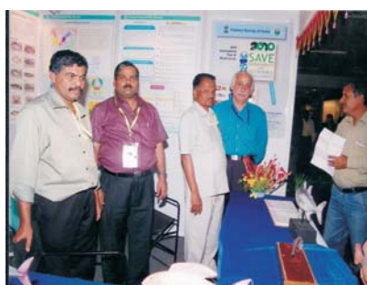
FSI participated in India International Trade Fair, held at New Delhi during 14-27 November 2010