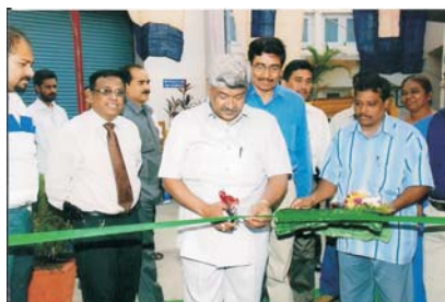
Inauguration of the seminar on 'International Year of Biodiversity-2010' organised by FSI at Visakhapatnam during 28-30 December, 2010